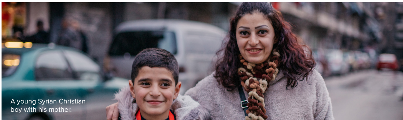
A young Syrian Christian boy with his mother.

Many other religious minorities face various levels of persecution including Shia, Alewite, Druze, Jews, Yazidis, and Zaradashtis. Shia, Alewite, and Druze communities have been marginalized and persecuted by Sunni jihadists, not only on the grounds of their faith being considered heretical but, in the case of the Alewites, also because of their perceived connections with the respective Assad presidents. Yazidis and Zaradashtis belong to Kurdish religions, which are not recognized by the Syrian regime. Their children are registered as Sunni Muslims and they learn Islam in school.