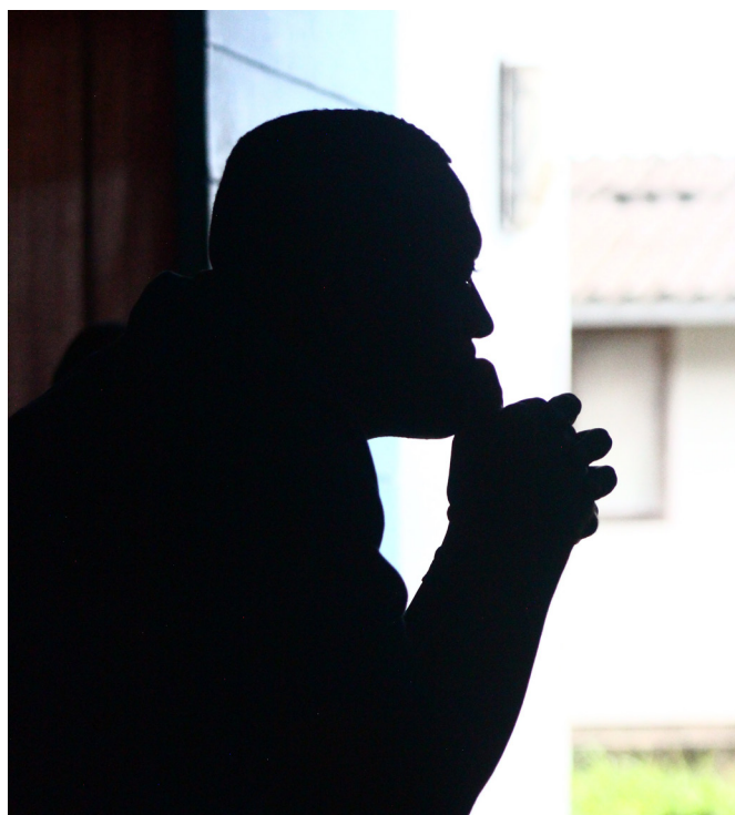
In the middle of violence and persecution the pastors of Buenaventura, Colombia, persist in preaching the gospel.

Long-term trauma care for victims can be the key element to help survivors deal with their paralyzing sense of helplessness. In addition, faith communities have the opportunity to reexamine the non-verbal message they send to their survivors of persecution. There are many responses to persecution events that inadvertently reinforce the value judgments of perpetrators and ensure the impunity with which they can act. This may be through reinforcing societal stigma for events over which a victim had no agency, or choosing to respond differently to men and women who have suffered.