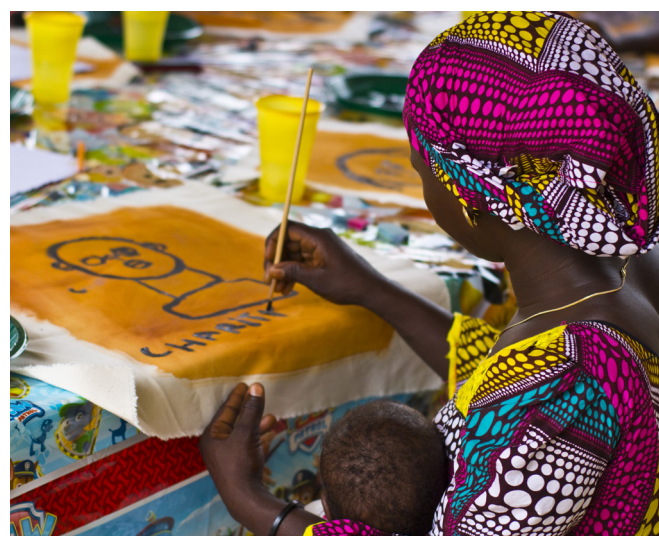
Charity was a participant of a trauma healing programme for survivors of sexual violence in 2018. She was held captive by Boko Haram for three years, as an 'infidel' and was forcibly married to a fighter. She became pregnant and gave birth to a baby girl.

In research into gender-specific violence, effort is being made not to hide gender-based violence behind the cloak of marriage. Thus, instead of counting violence as domestic, we are counting it as physical violence. Further analysis of the use of sexual violence and forced marriage are included below in "Investigating violence against women and girls."